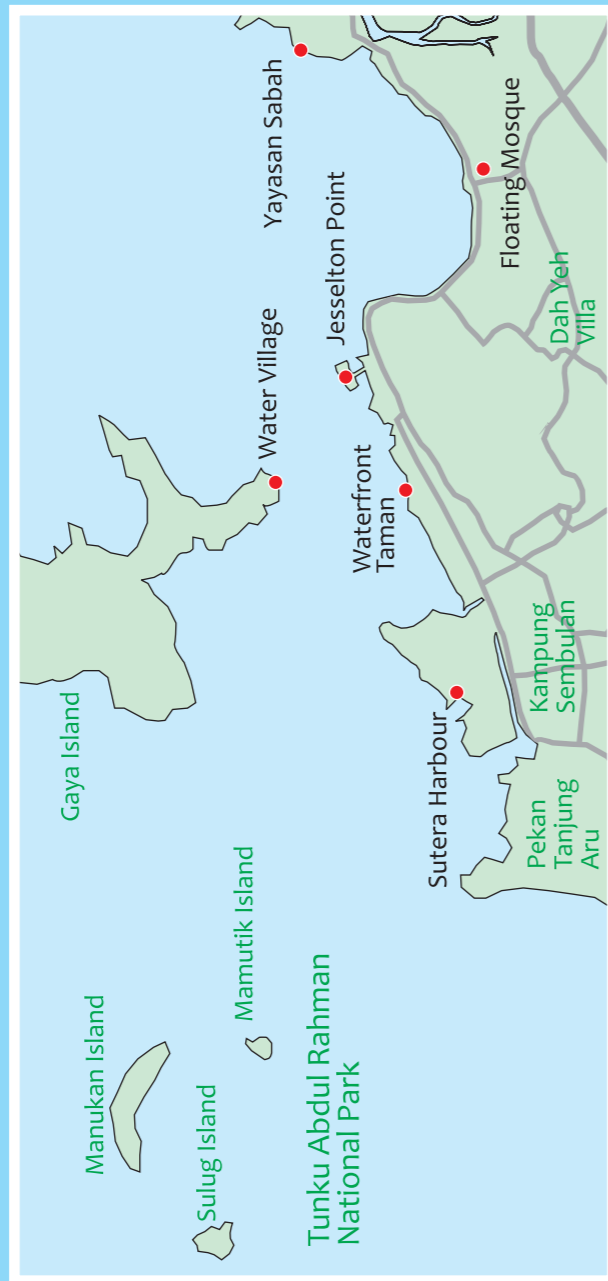
以上的地图只是用于展示用途 Map is drawn and not to scale. It can be used for reference purposes.

Guest are required to be at Jetty Waiting Area before Boarding Time. The Boat practice a punctual departure time and will not wait or entertain late arrivals. All tickets sold are not refundable.